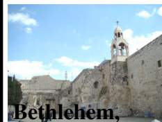
Bethlehem, Church of the Nativity